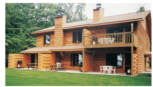
1, 2 & 3 Bedroom Condos (70's)

Our 1-2-3 Bedroom Condos have all the deluxe features to make your stay comfortable. These spacious Condos feature a complete kitchen with dishwasher, range, microwave, refrigerator, dishes, pots, pans, silverware, toaster and coffee maker. If the weather is cool, warm yourself in front of a crackling fire in the fireplace. Wood is provided. Each has central air-conditioning & forced air heat. The 1 bedroom Condos sleeps 4 with a queen bed and a hide-a-bed in the living room. There is a full bathroom with shower or tub/shower. The 2 bedroom Condo sleeps 10, and has (2) bedrooms on second floor with a queen size bed and a double in each bedroom and a hide-a-bed in the living room. There are 2 ½ bathrooms. The 3 bedroom Condo sleeps 12, and has bedrooms on first & second floor with (2) queen beds, (3) double beds, and hide-a-bed in the living room. There are 3 ½ bathrooms. Cable TV, wifi & phone. A gas grill and picnic table are located on your private patio. Linens and blankets are on the beds. (Please bring towels and soap for the kitchen and bath; dishwasher soap is provided.) Rental towels are available; please reserve in advance.