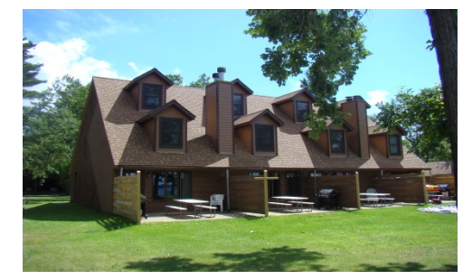
Our 3 and 4 Bedroom Condos have all the deluxe features to make your stay comfortable. These spacious Condos feature a complete kitchen with dishwasher, range, microwave, refrigerator, dishes, pots, pans, silverware, toaster and coffee maker. If the weather is cool, warm yourself in front of a crackling fire in the fireplace. Wood is provided. Each has central airconditioning & forced air heat. 2 full baths (walk-in shower on first floor and tub-shower combination on second floor). The 3 bedroom sleeps 10 with 2 queen beds, 2 double beds (located on 2<sup>rd</sup> & 3<sup>rd</sup> floors) & a hide-a-bed in the living room. The 4 bedroom sleeps 12 with 2 queen beds, 3 double beds (located on 1<sup>st</sup>, 2<sup>rd</sup> & 3<sup>rd</sup> floors) & a hide-a-bed in the living room. Cable TV, wifi & phone. A gas grill and picnic table are located on your private patio. Linens and blankets are on the beds. (Please bring towels and soap for the kitchen and bath; dishwasher soap is provided.) Rental towels are available; please reserve in advance.