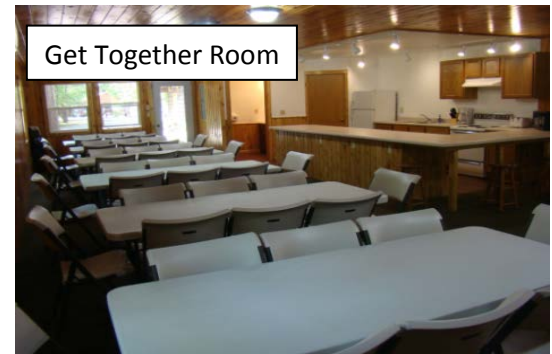
Get Together Room

1 to 5 Bedroom Cabins, Condos & Chalets Providing your group with the lodging choices that will fit your needs.